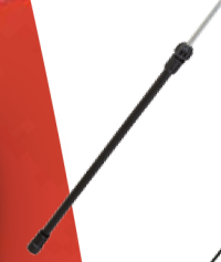
Telescopic extension 0.45 – 0.9 m Art.No. 11659001-SB