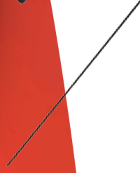
Spray tube, plastic 1 m Art.No. 11497403