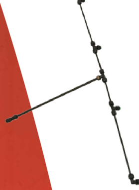
Spray boom, plastic Art.No. 1165601-SB