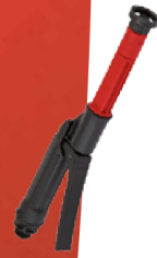
Vario Gun Art.No. 1156501