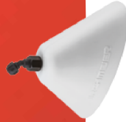
Spray head, oval, white Art.No. 11871101