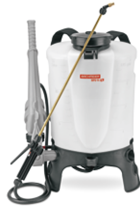
RPD 15 ABR Art.No. 11924701